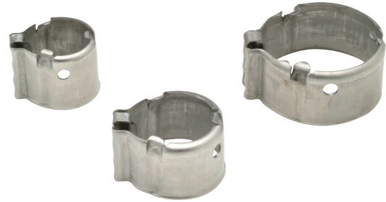
QickClamp Crimp Rings Available in 3/8", 1/2", and 3/4"